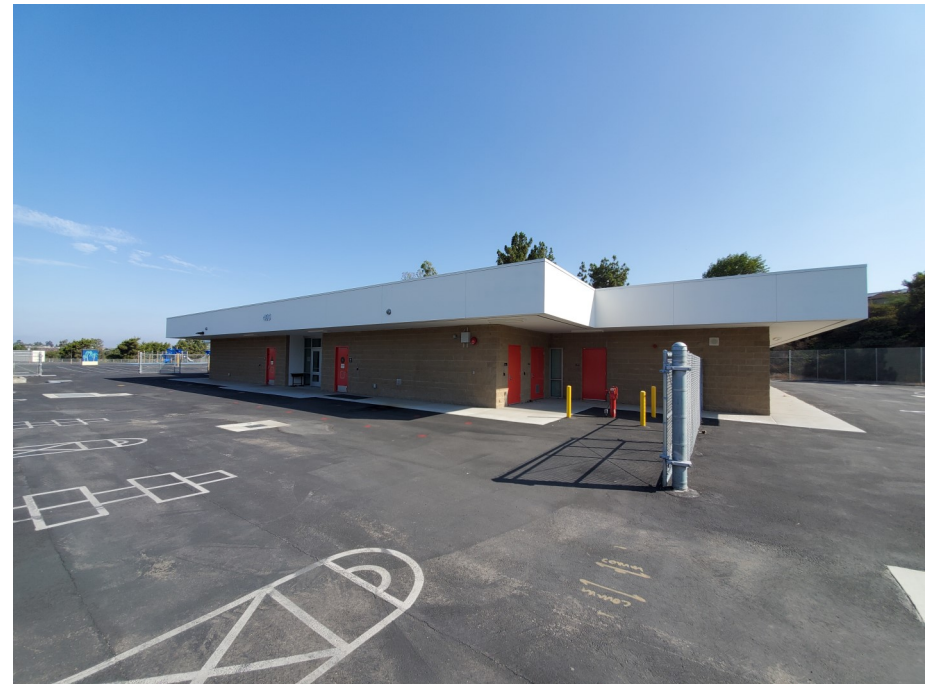
Exterior of Campus