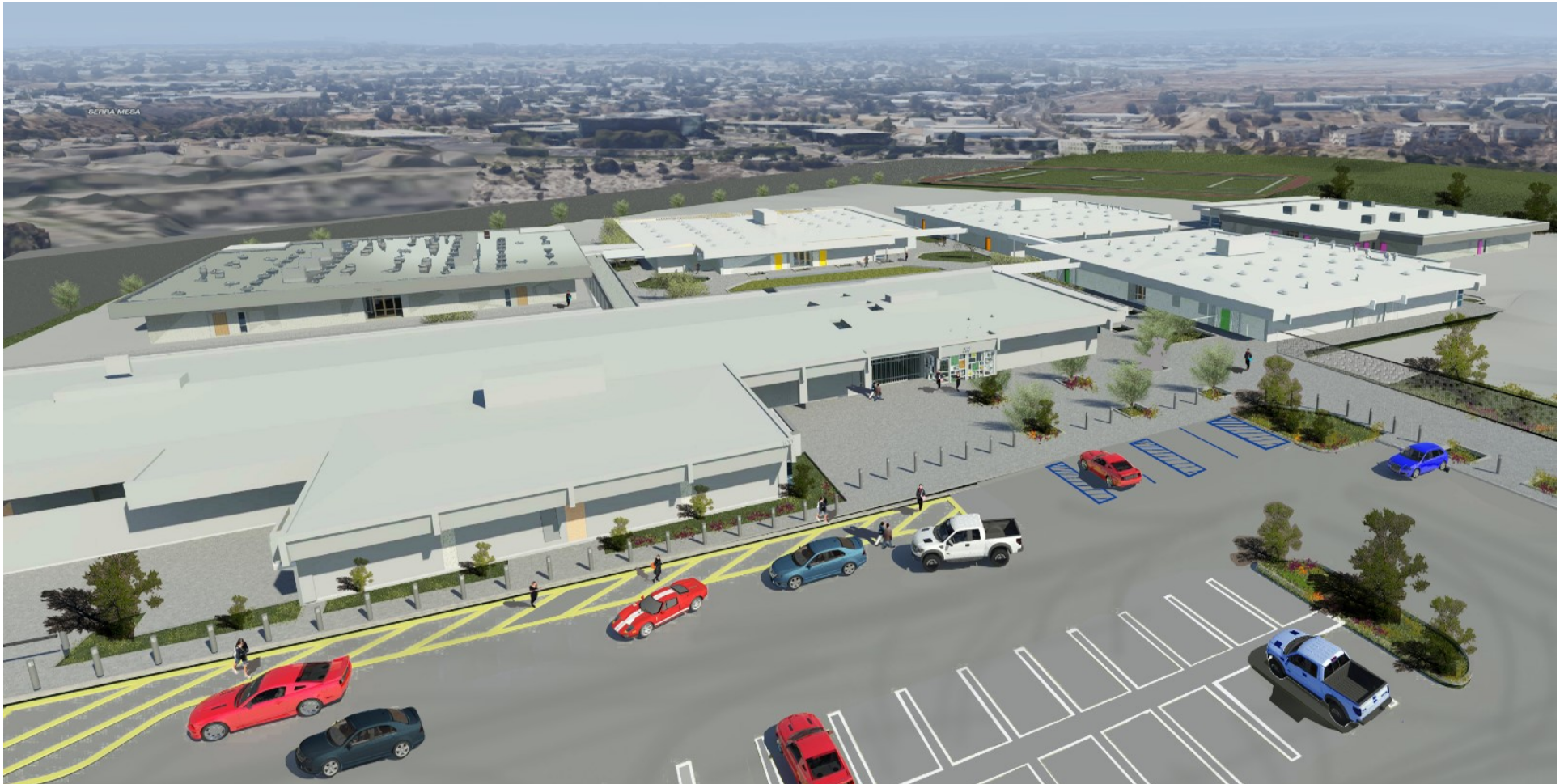
Rendering of completed Whole Site Modernization Project